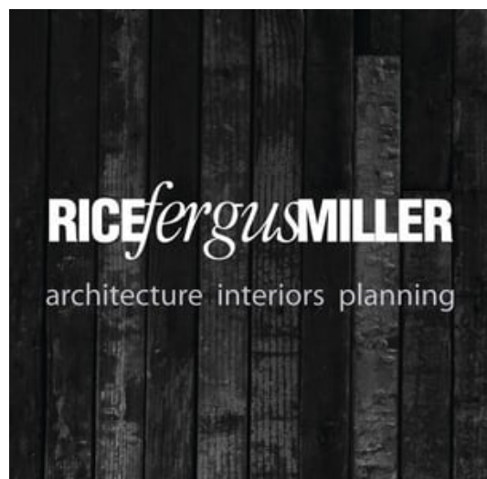
Below: Logo of Rice Fergus Miller as found on their website: http://www.rfmarch.com/