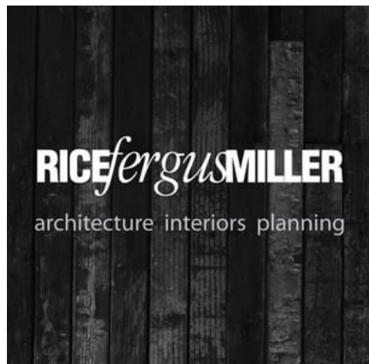
Below: Logo of Rice Fergus Miller as found on their website: http://www.rfmarch.com/